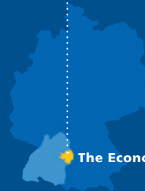
The Economic Region Ostwuerttemberg